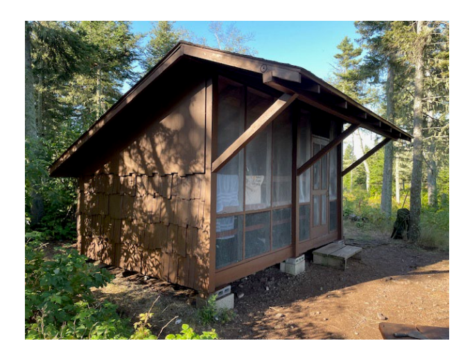
Shelter with a nice fresh coat of paint.