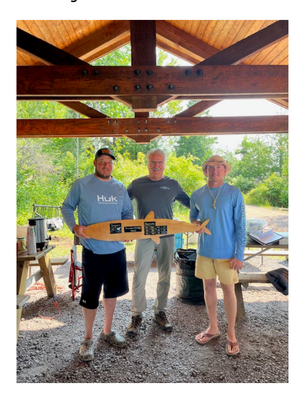
The Michigan Fishermen with the Wooden Herring Award

The Michigan fishermen took the Wooden Herring Award with a total weight of 88.10 lbs. This was a close one as the Minnesota fishermen had a total weight of 87.47 lbs. Congratulations to the Michigan Fishermen!